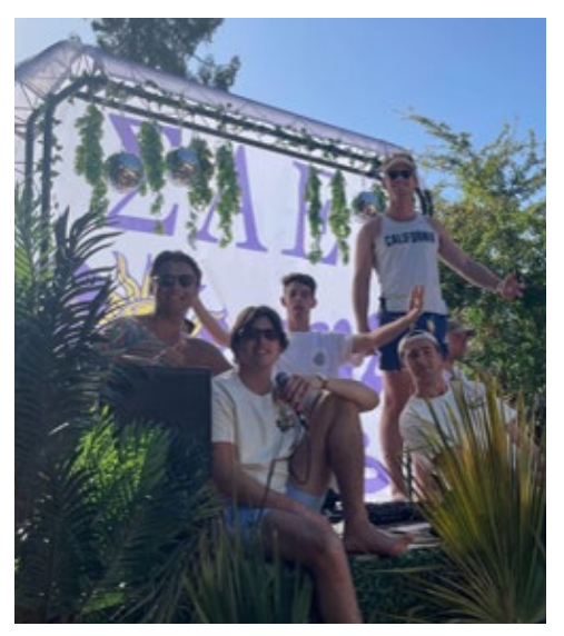
South Seas in the 70s, versus now.