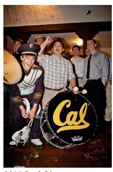
2011 Duck Dinner.