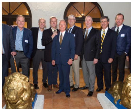
125th Anniversary Celebration