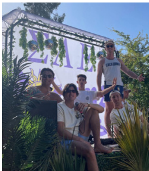
South Seas in the 70s, versus now.