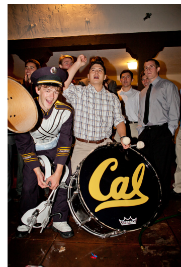
2011 Duck Dinner