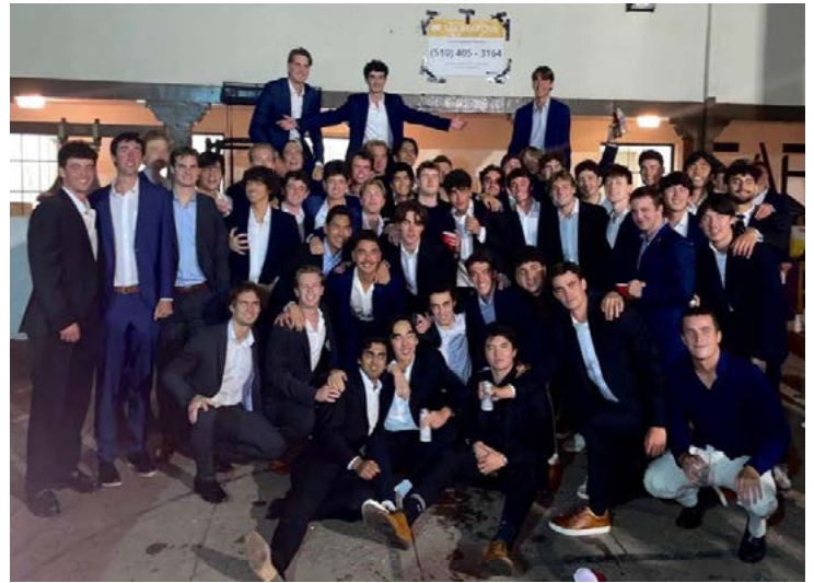
Our Spring Formal