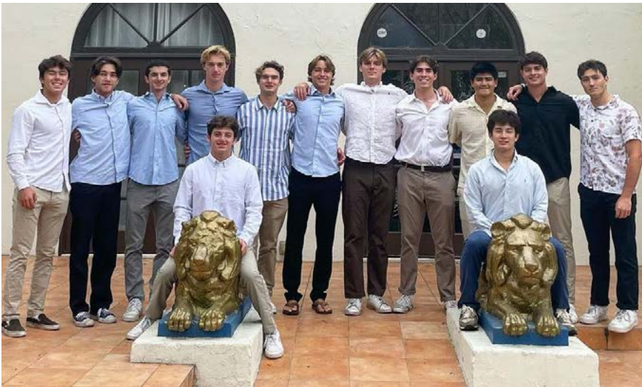
Our newest classes, Fall '23 and Spring '24