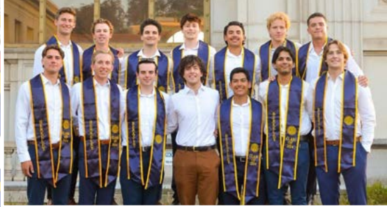
Our Graduating Seniors